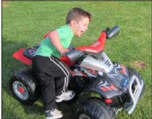
Harrison Schick 9-Oct-09 to 9-Dec-11

Old North Road, RD 2, Waimauku, Auckland, Telephone: 09 411 8248 Freephone: 0800 846 800 E-mail: info@vineyardcottages.co.nz Web: www.vineyardcottages.co.nz