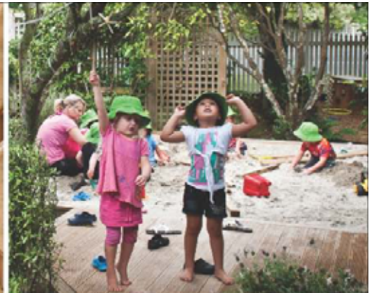
Welcome to our Place - Where Discovery Comes Naturally