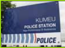
Kumeu Police Ph 412 7756