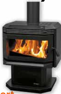
Masport Hestia 2 Fireplace 321155