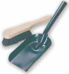
Browns Fire Brush & Shovel Set 324032