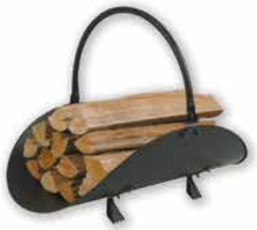
Nouveau Log Holder With Handle 366517

Mitre 10 MEGA Westgate & Henderson Northside Drive & Lincoln Road Monday - Friday: 7am - 7pm Weekends: 7am - 7pm