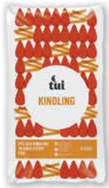
Tui Bagged Kindling 297168