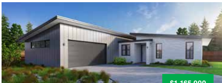
Country Living, Turn Key!