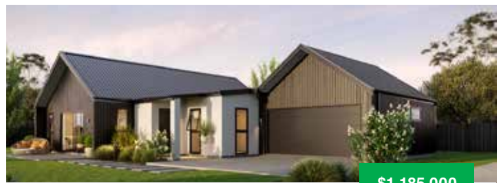
Wood Valley Wonderland!

House 181m 2 | Section 629m 2 | 3 | 2 | 1 | 1 | 2