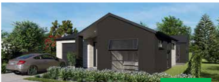
Tick The Boxes In Huapai

House 186m 2 | Section 18510m 2 | 3 | 2.5 | 2 | 2