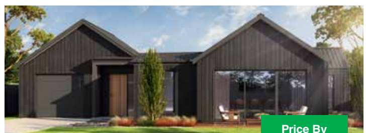
Architectural Kiwitahi Haven

House 144m 2 | Section 357m 2 | 3 | 2 | 1 | 1